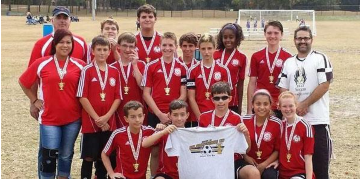
2014 NFYSL Commissioner's Cup U16 1st Place Champions - U16 Baird - CCSC Jedi Force